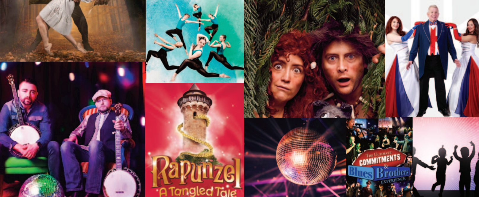
Book online at: www.guildhallartscentre.com

We are unable to refund money or tickets once a purchase has been made. If an event is sold out, we will try to sell unwanted tickets and if successful, your Guildhall Arts Centre account will be credited the money.